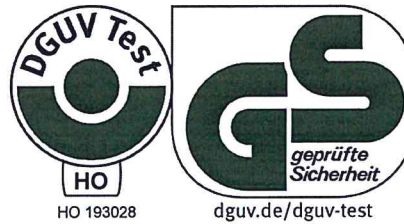
Approved design for a height of 20 mm or less: