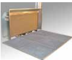
Water basins with grates Art.-No. 517 400