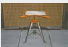
Spraying and varnishing pillar Art.-No. 517 300

Moving device Art.-No. 517 140 4 caster wheels, 2 fixable