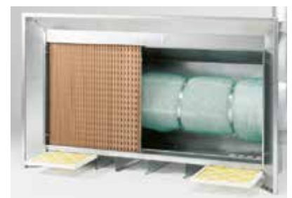
Easy accessibility ensures fast, unproblematic replacement of the cost-effective filters.

Push-in floor filter: 517 130 500 x 500 x 20 mm