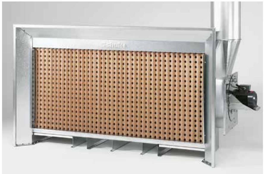
Solid compact design with low construction depth - just right for small rooms and factories.

Your factory, your employees, your neighbours and your own health will thank you.