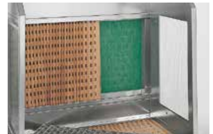
The filters, prefilter and fine filter, can be changed in a few simple steps.